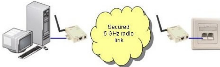
INTERCONNECTION BETWEEN TWO ETHERNET NETWORKS